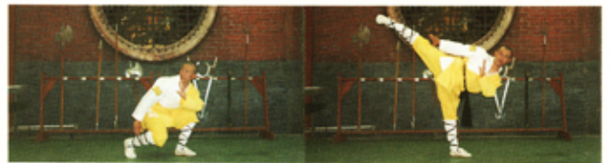
Hou deng tui