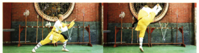
Teng kong wai bai jiao