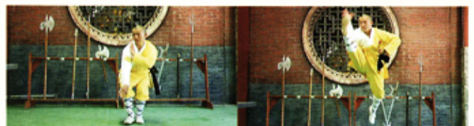
Teng kong er qi jiao