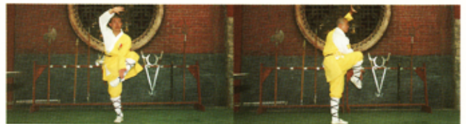
Xie zi wei