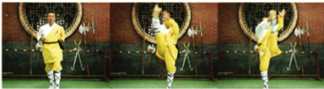
Wai bai jiao