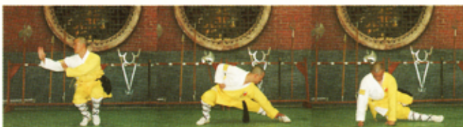
Gian sao tui