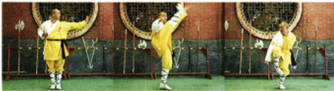
Gua mian jiao