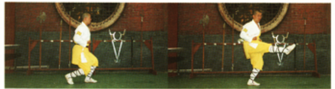
Di tan tui