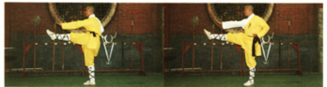
Dan pai jiao