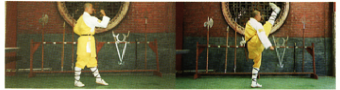
Zheng ti tui