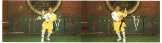
Xu bu liang zhang