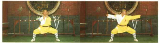
Ma bu dan bian