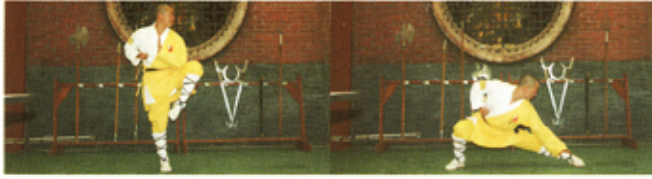
Pu bu qie zhang