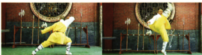
Teng kong xuan feng jiao