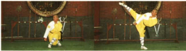
Ce ti tui