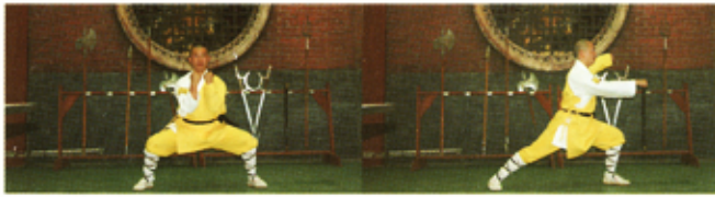
Gong bu xie xing