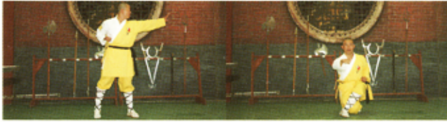
Xie bu chong quan