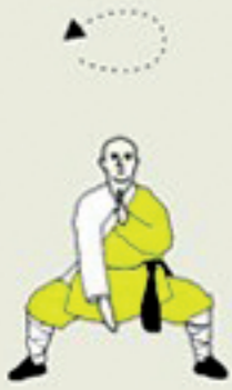
Dan shou he zhang