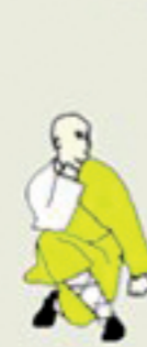
Ce chuai tui / Gua zhou