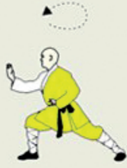
Shang bu chong zhan