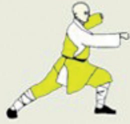
Ge zhou chong quan