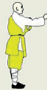
Ying mian da