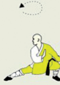
Pu bu gou shou liang zhan