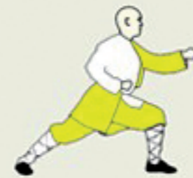
Zhuan shen chong quan