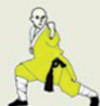
Qi hui dan tian