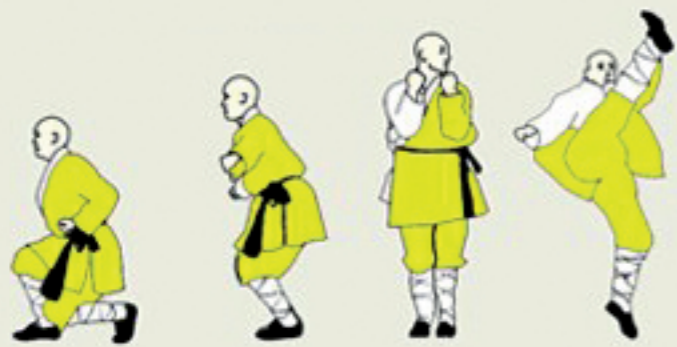
Lou xi pi chai zeng qi li