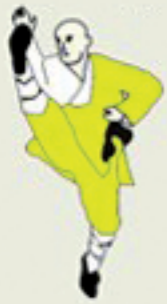
Shang bu teng kong er qi jiao