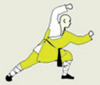
Wan fo gui zong