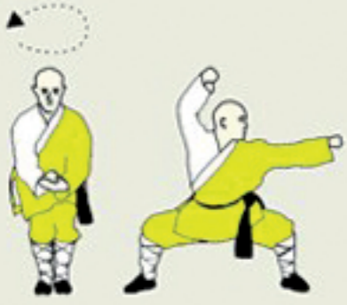
Zhuan shen ma bu chong quan