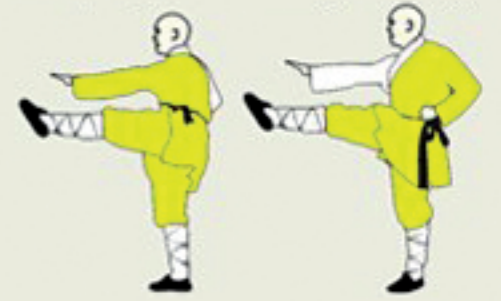
Er bu dan pai jiao