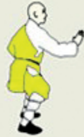
Li pi hua shan