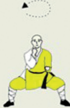
Xuan feng jiao ma bu ge zhou