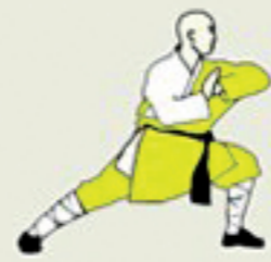
Lun shou ding zhou