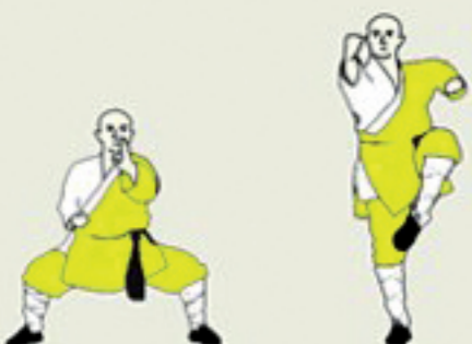
Jin gang dao chui