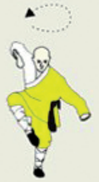
Hai di lao yue