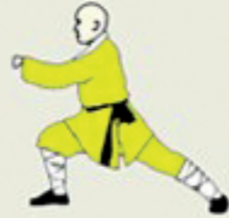
Shuang feng guan er